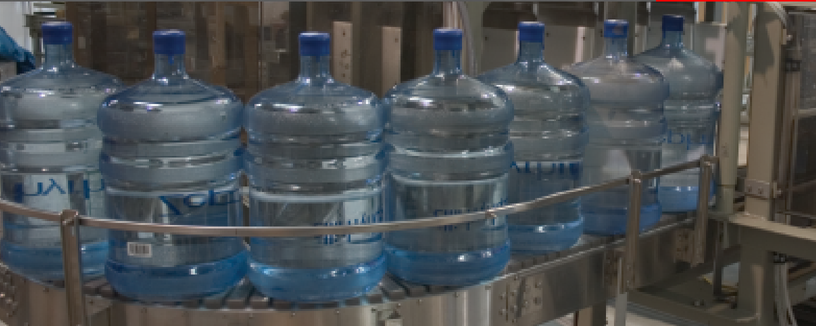
BRL 1800 / 3/5 Gallon Bottle Rack Loader